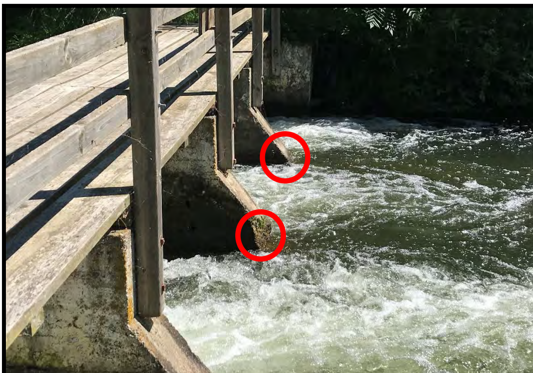
Significant Scour and Spalling on Downstream Piers