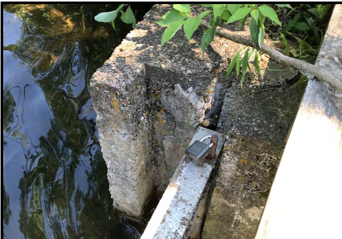
Significant Cracks and Concrete Deterioration at Left Abutment