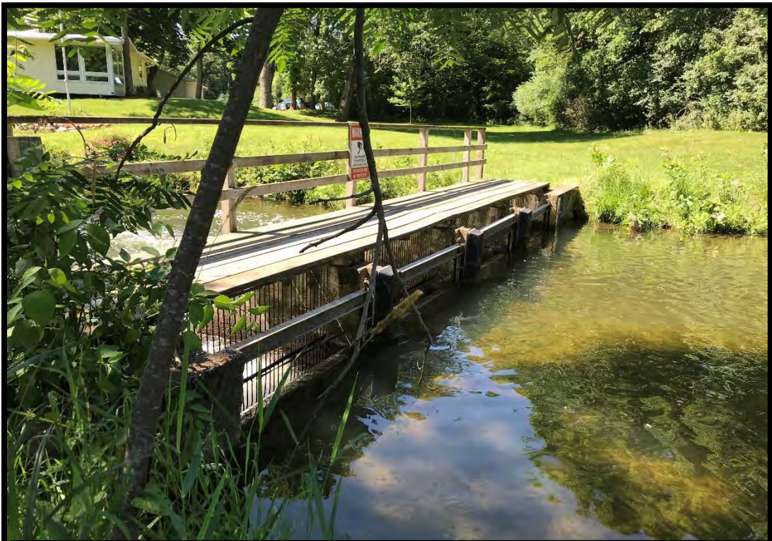
Upstream View of Cedar Lake Dam. Note Bumpers on Piers & Tree at Left Abutment