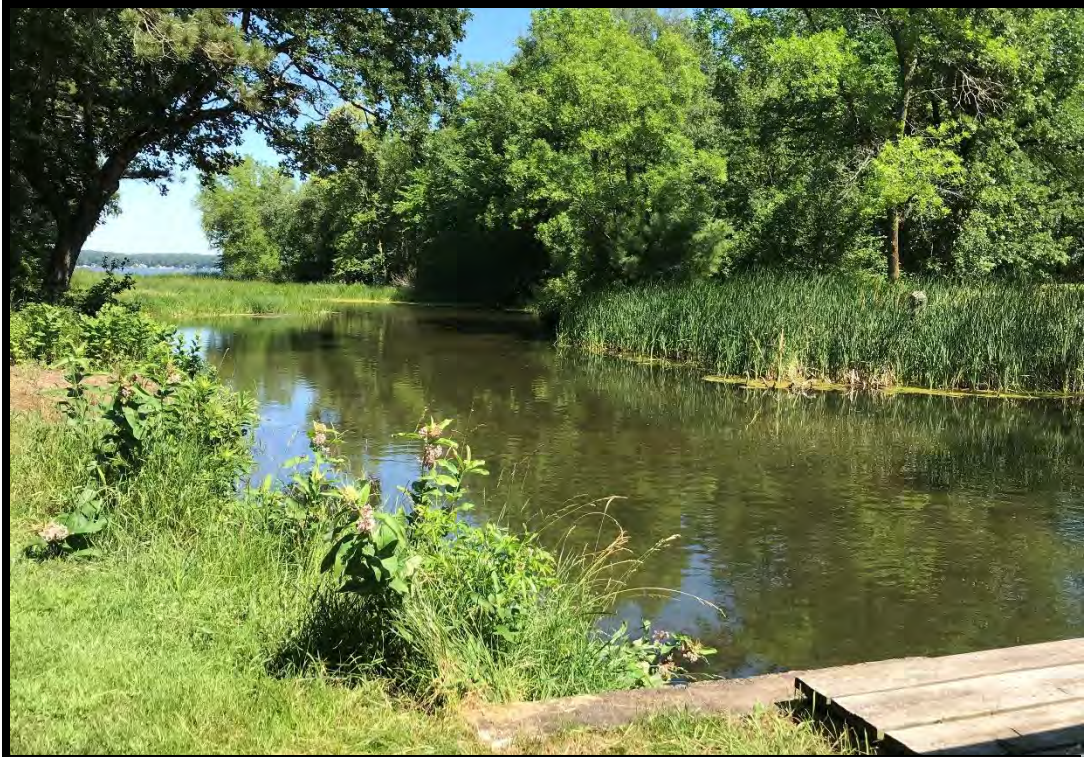
Upstream Impoundment of the Cedar Lake Dam