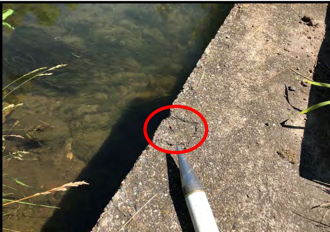
Benchmark 632-F, Square Cut on Right Abutment (Not Surveyed)