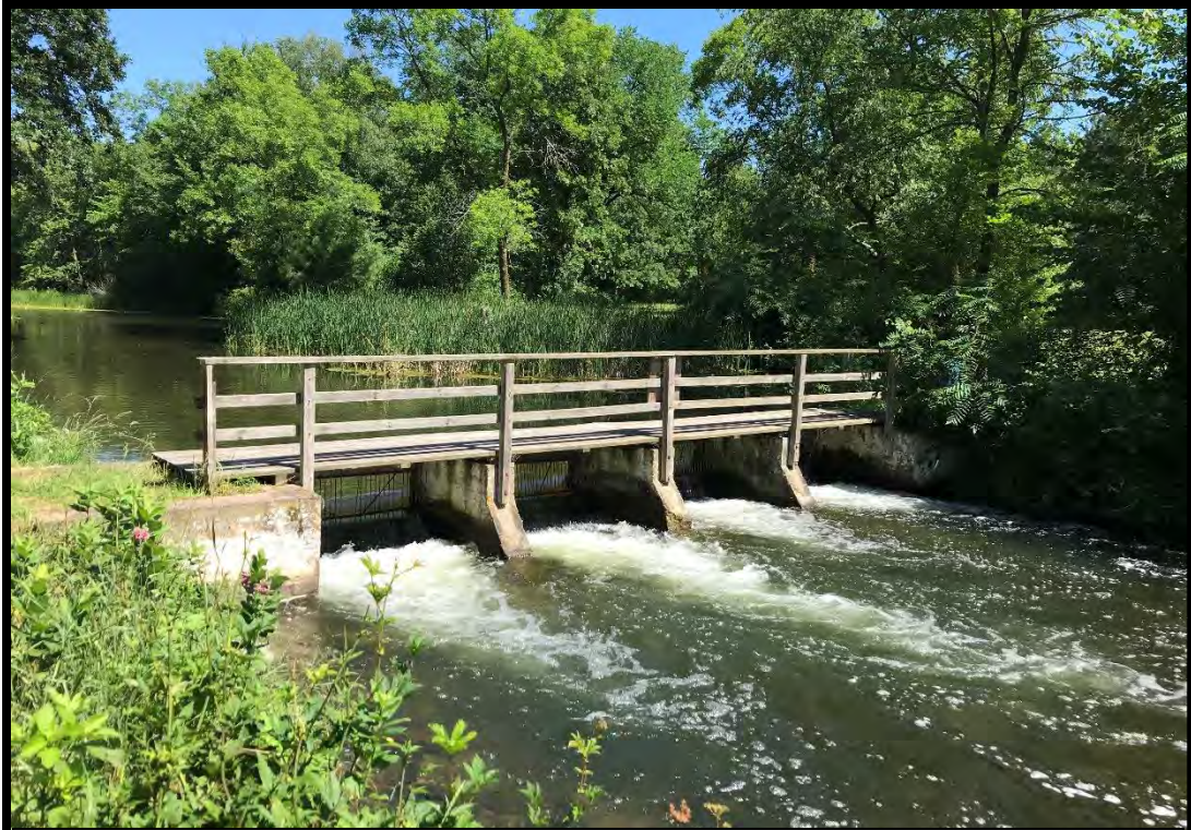
Downstream view of the Cedar Lake Dam