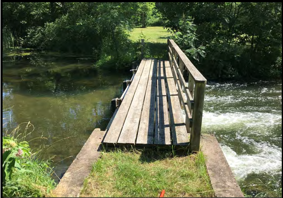
Crest of the Cedar Lake Dam. Wooden walkway and railing for access & operation.