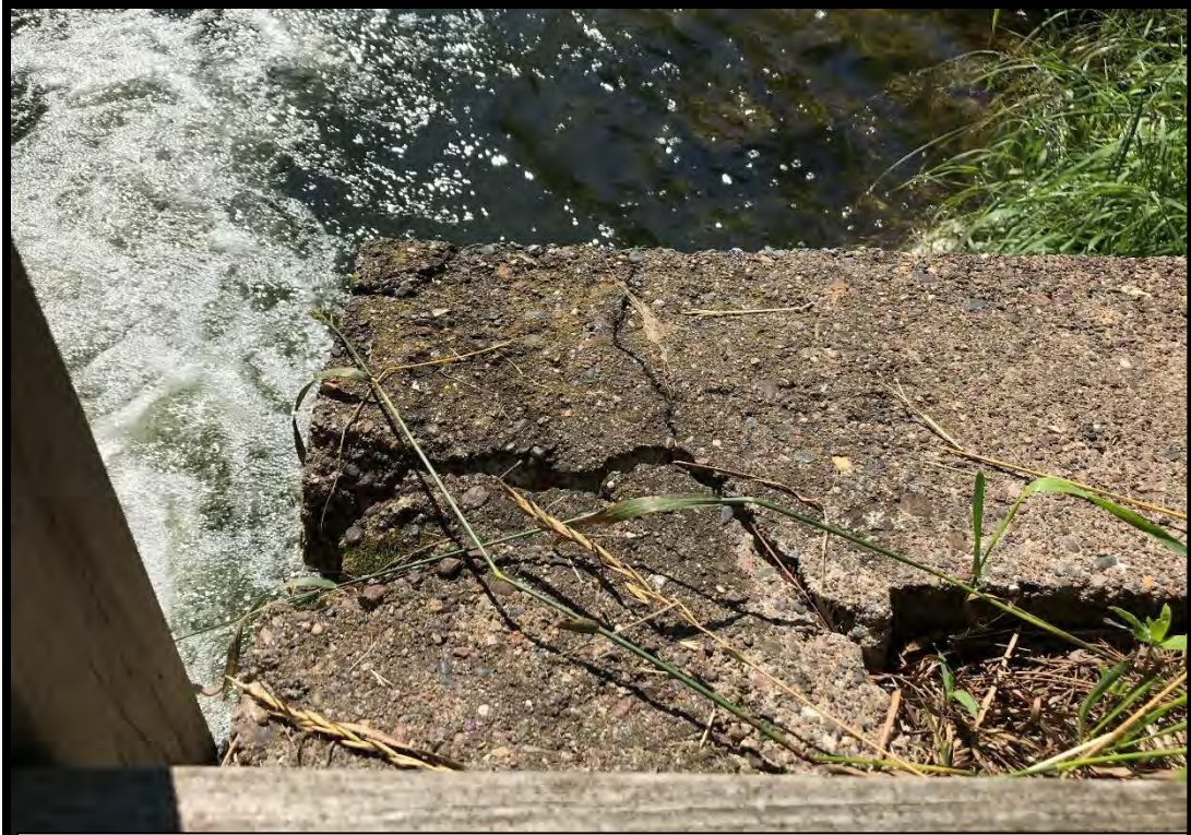
Significant Cracks and Concrete Deterioration at Right Abutment