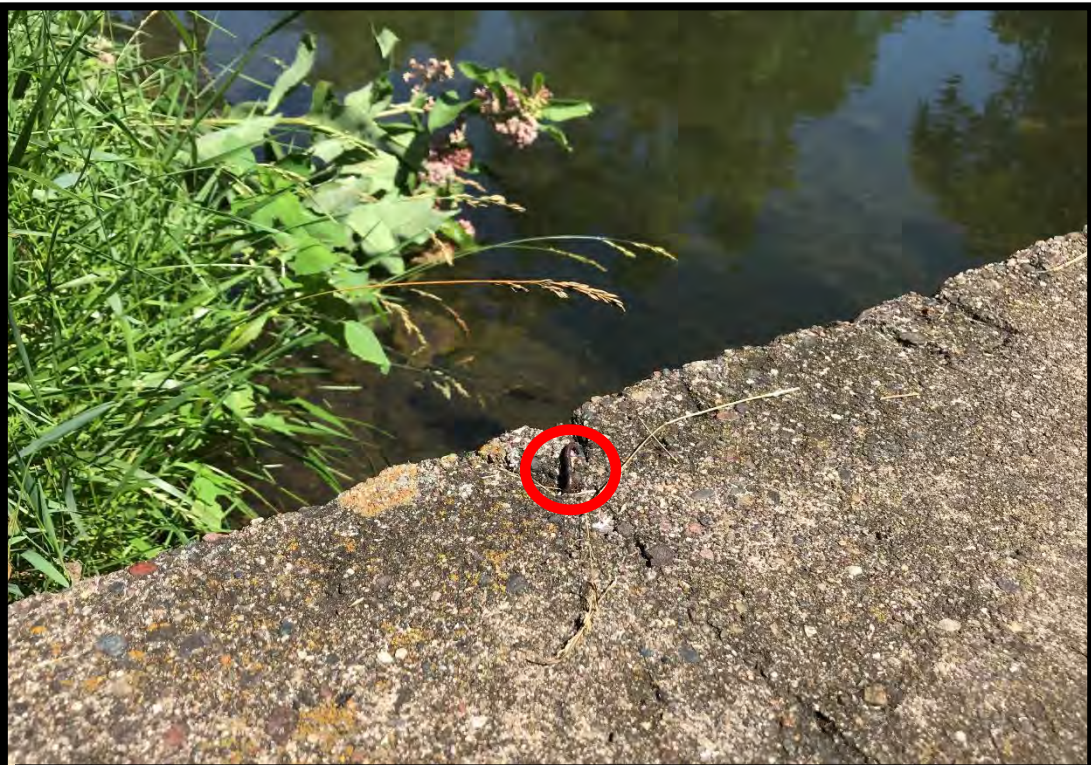
Steel pin found at Right Abutment. May be indication of Reinforcement.