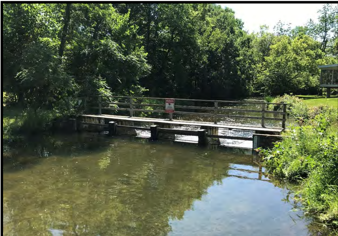
Upstream View of the Cedar Lake Dam