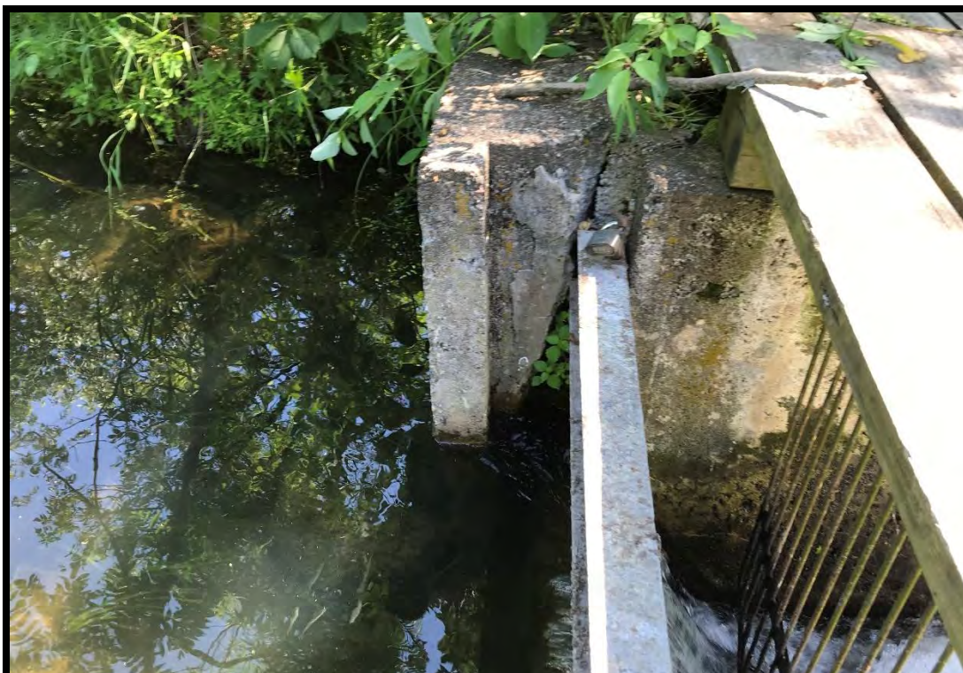
Significant Cracks and Concrete Deterioration at Left Abutment