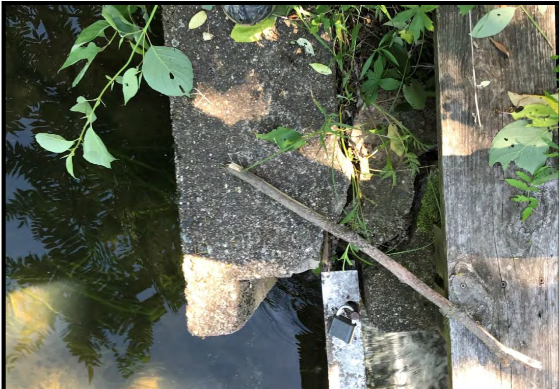
Significant Cracks and Concrete Deterioration at Left Abutment